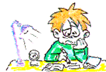
You study late night for a final