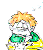
The next day you are very sleepy